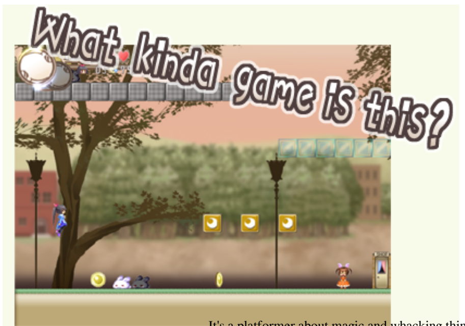
It's a platformer about magic and whacking things!